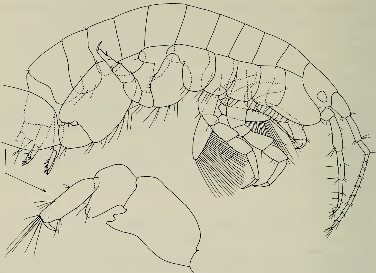
Fig. 1. Stenocorophium bowmani : male, lateral view.

Maxilliped: inner lobe with a row of marginal plumose setae; outer lobe bearing a row of slender spines along inferior margin; palp 4-articulate, article 2 elongate, article 3 short, not lobed, article 4 short with distal spines (Fig. 5A).